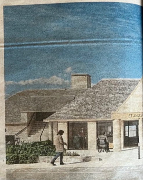
An artist's impression of how the clubhouse could look

New windows will offer uninterrupted, expansive views of the Links from the bar and grill, whilst an upgraded roof terrace will take advantage of the views across the Links and back