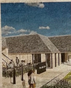
The view from the cafe

The Links Clubhouse is the main hub of activity at the renowned venue, catering for golfers playing the three oldest courses in the