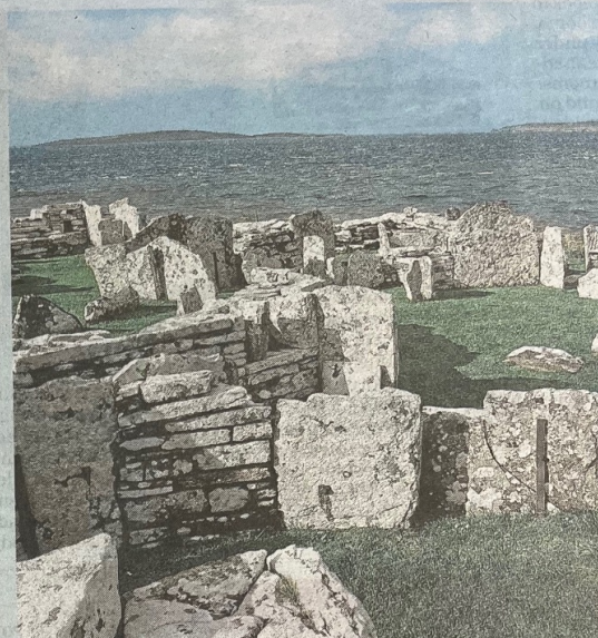
The Brock of Gurness, an iron age settlement on Orkney's main island